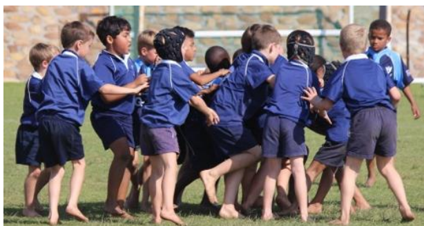
Mini-rugby Tournament – Saturday 3 August Gordon’s Bay Primary School Rhenish Primary U7 team in action!