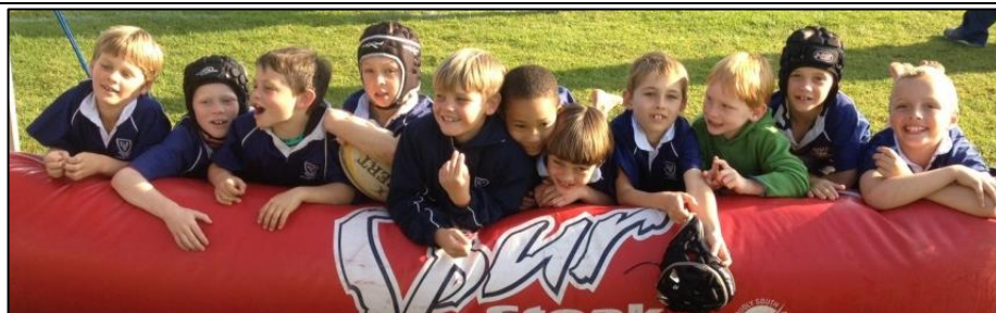
Mini-rugby Tournament – Saturday 3 August Gordon’s Bay Primary School U8 Team